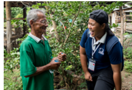
USAID helps fight diseases by building vulnerable communities' resilience and sharing life-saving knowledge and prevention practices.