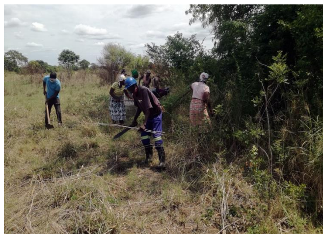
Participants in the USAID/BHA-funded Tsima-Tsima program clear a field before planting seeds distributed by USAID/BHA partner SCF.

With USAID/BHA support, Save the Children Federation (SCF) continued to implement its Tsima-Tsima program to enhance the resilience of communities susceptible to climatic shocks in 75 communities across Mozambique's Gaza Province. To mitigate the effects of irregular rainfall and recurrent drought on agricultural production, SCF provided five districts with nine irrigation pumps, watering nearly 170 acres of agricultural land during FY 2022. The irrigation systems enabled approximately 270 farmers to grow staple crops—such as maize—throughout the year that had