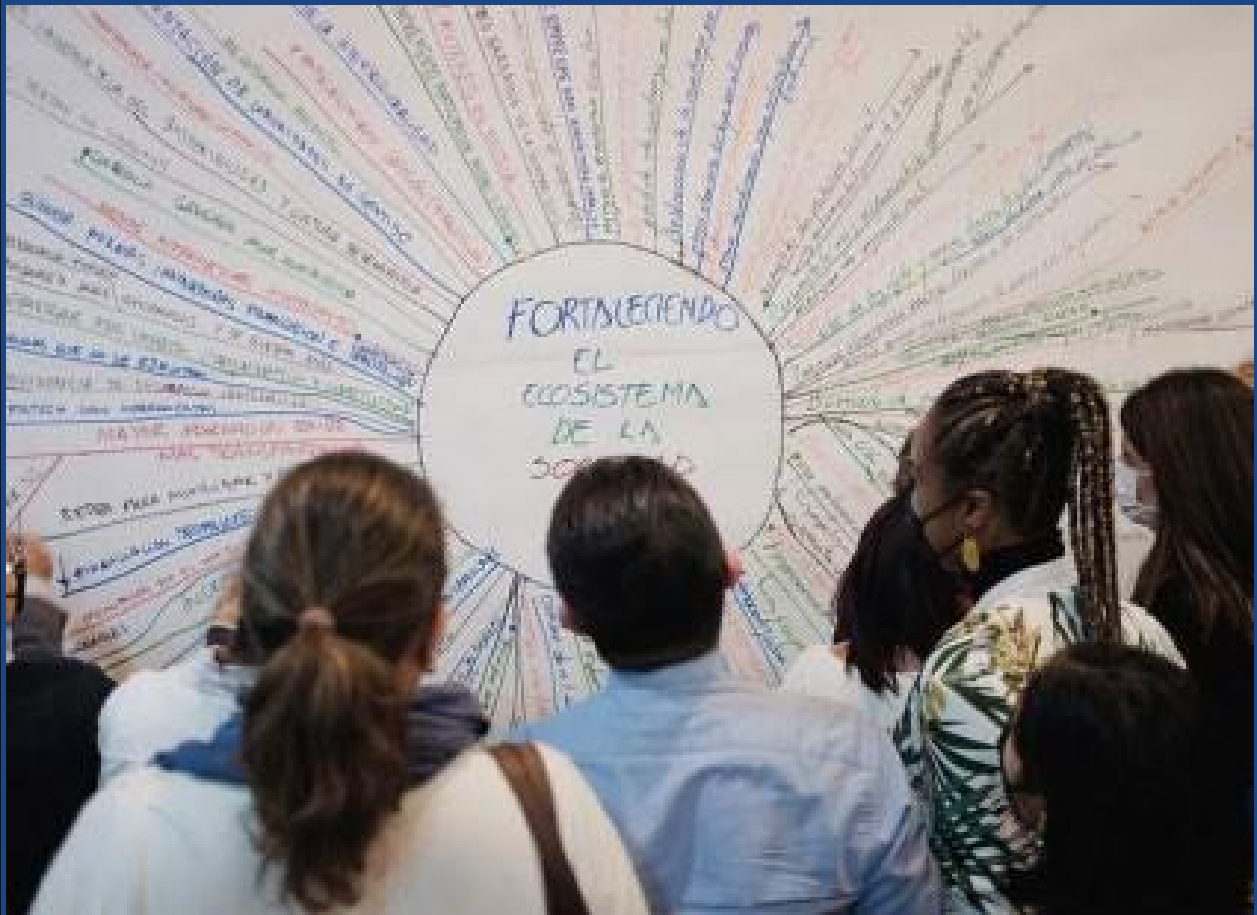
Photographer: Andres Felipe Castilla, FHI 360 Strengthening Together Activity, 2023 DRG Photo Context Top 10 Finalist, November 9, 2023.