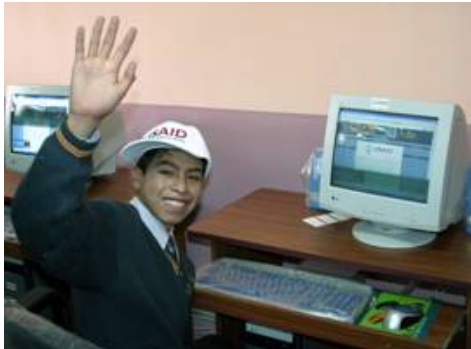
USAID supports more equitable access to education and technologies for disenfranchised students.