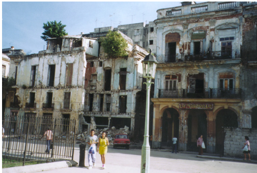
A square in Old Havana; USAID's Cuba program promotes self-determined democracy in Cuba.