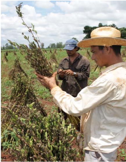
Paraguay farmers collecting sesame, a highly desired product in the international market. The "Paraguay Sells" program has helped to open new markets for small and medium scale growers to increase their income, diversify their production and provide a better quality of life in rural areas.